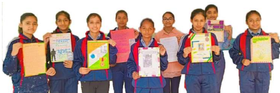
Students with their entries after participating in Veer Gatha Project

As part of this project, the students can again frame different projects on gallantry award winners. Interdisciplinary and art-integrated activities like poem, essay, story, painting/drawing, videos would be considered as project activities. The best project will be rewarded nationally by MoD on the forthcoming Republic Day. The submission by the students can be made in any of the 22 Scheduled languages and English.