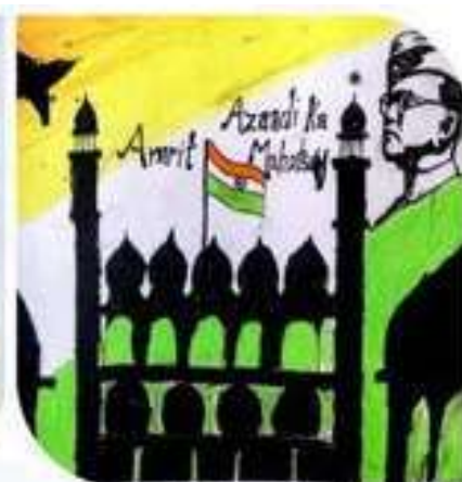
Some student entries from the First Edition of Veer Gatha Project

Out of total participations, a total of 19,123 shortlisted entries were uploaded by CBSE schools on the CBSE portal and 2701 entries were uploaded by the State Boards Schools on MyGov portal. The responsibility to evaluate the entries uploaded by CBSE schools were entrusted to 16 CBSE CoEs (Centre of Excellence) situated at different states in India. Teachers were deputed to evaluate the entries at regional level. Similarly, SCERTs were entrusted to evaluate the entries received on MyGov portal. After CBSE regional level and SCERT level evaluation,