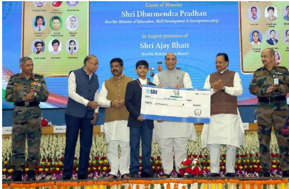
Hon'ble Raksha Mantri Rajnath Singh present award prize during the felicitation ceremony on 12 August 2022