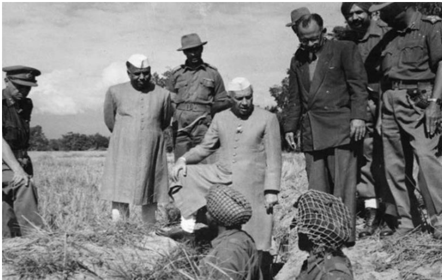
Prime Minister Jawaharlal Nehru with troops at a forward position during the 1962 India-China war.