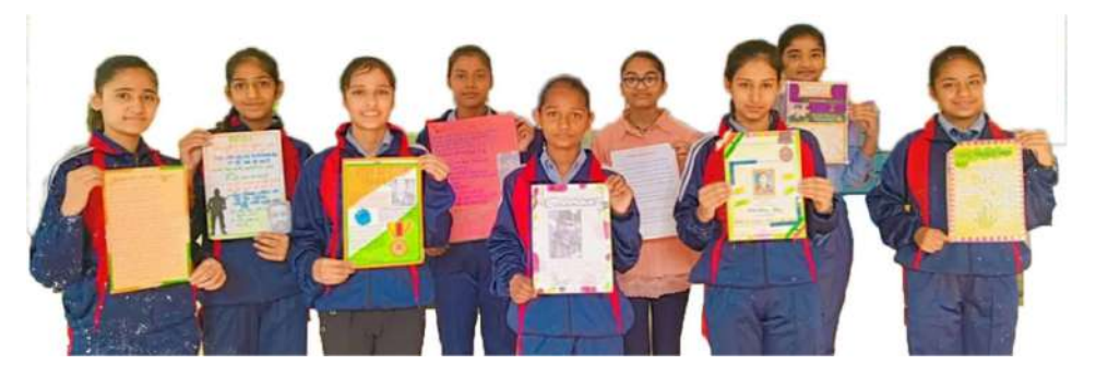
Students with their entries after participating in Veer Gatha Project

As part of this project, the students can again frame different projects on gallantry award winners. Interdisciplinary and art-integrated activities like poem, essay, story, painting/drawing, videos would be considered as project activities. The best project will be rewarded nationally by MoD on the forthcoming Republic Day. The submission by the students can be made in any of the 22 Scheduled languages and English.