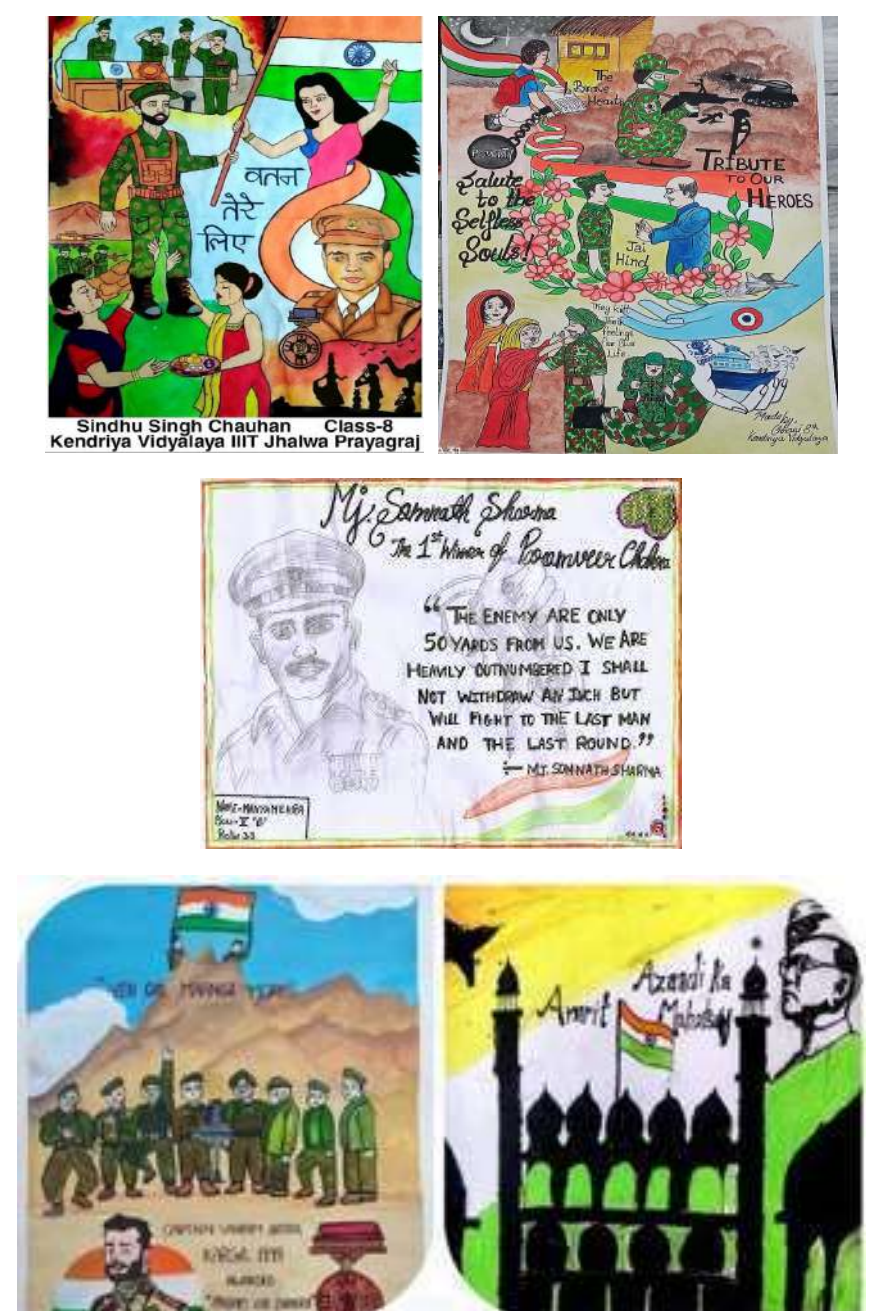
Some student entries from the First Edition of Veer Gatha Project

Out of total participations, a total of 19,123 shortlisted entries were uploaded by CBSE schools on the CBSE portal and 2701 entries were uploaded by the State Boards Schools on MyGov portal. The responsibility to evaluate the entries uploaded by CBSE schools were entrusted to 16 CBSE CoEs (Centre of Excellence) situated at different states in India. Teachers were deputed to evaluate the entries at regional level. Similarly, SCERTs were entrusted to evaluate the entries received on MyGov portal. After CBSE regional level and SCERT level evaluation,