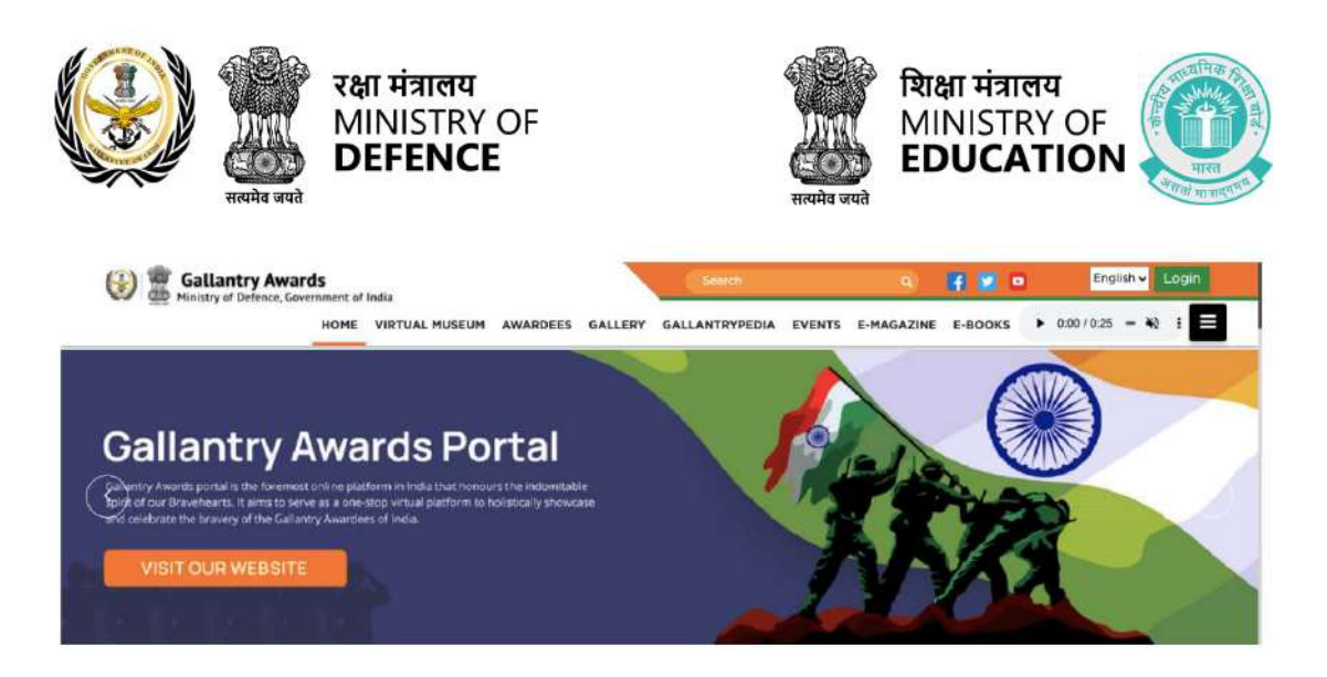
Gallantry Award Portal Website